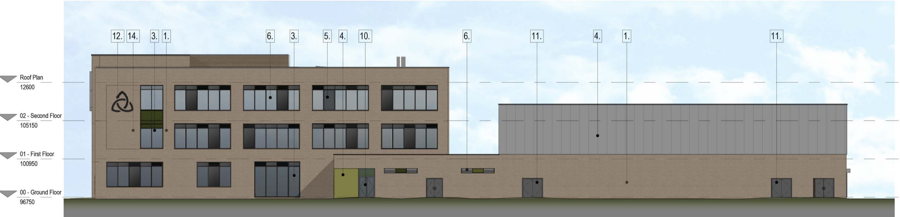
3 North Elevation 1 : 200