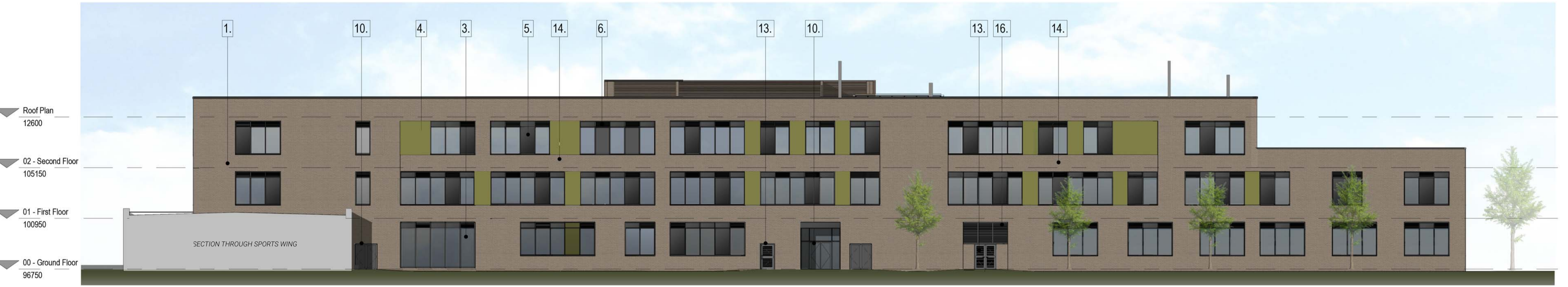
2 West Elevation (Rear) 1 : 200